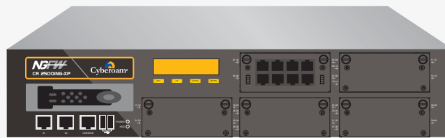
Flexi Ports Module